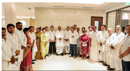
Attending a meeting of the Uttarakhand PCC leadership alongside Kharge ji.