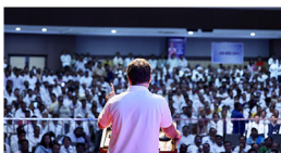
Addressing a Congress Workers Convention in Bhopal.