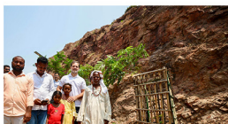
Paying tribute to the mountain man, Dashrath Manji in Gaya ji.