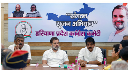
Meeting senior leadership of the Haryana PCC in Chandigarh.