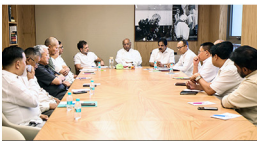
Discussing the law and order situation in Manipur with Manipur PCC.