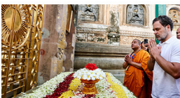
Offering prayers at Mahabodhi Vihar, Bodh Gaya.